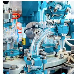
Ohio Chemical Manufacturing Plant Fire