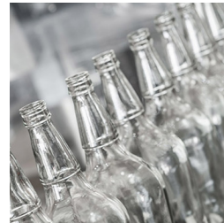
Owens-Illinois Glass Manufacturing