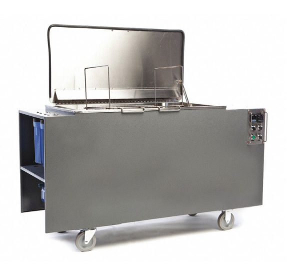
Grainger 50 gal. Ultrasonic Cleaner

The semiconductor industry led the way in development of PCB cleaning methodologies. While adopted by military, space and industries that had a need for similar processes, every sector tailored their cleaning protocols based on quantified contaminants, composition of electronic components and minimizing adverse effects.