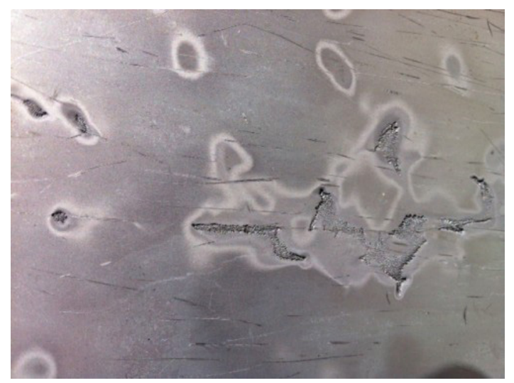
Example of cavitation erosion - Cleaning Technologies Group, LLC

The decades-long availability of ultrasonic cleaning has resulted in numerous studies that addressed technology benefits and areas of concern, where perhaps additional material degradation/damage testing is required.